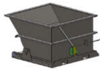
Self-tilting hopper 1,25 yd 3