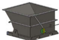
Self-tilting hopper 1,9 yd 3