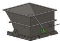
Self-tilting hopper 1,25 yd 3