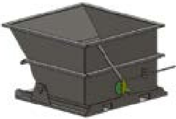
SELF-TILTING HOPPER 1,9YD 3